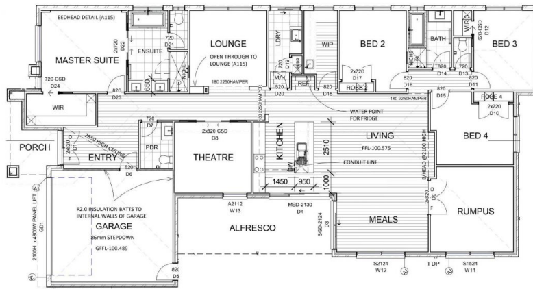
FLOOR PLAN SCALE: 1 : 100