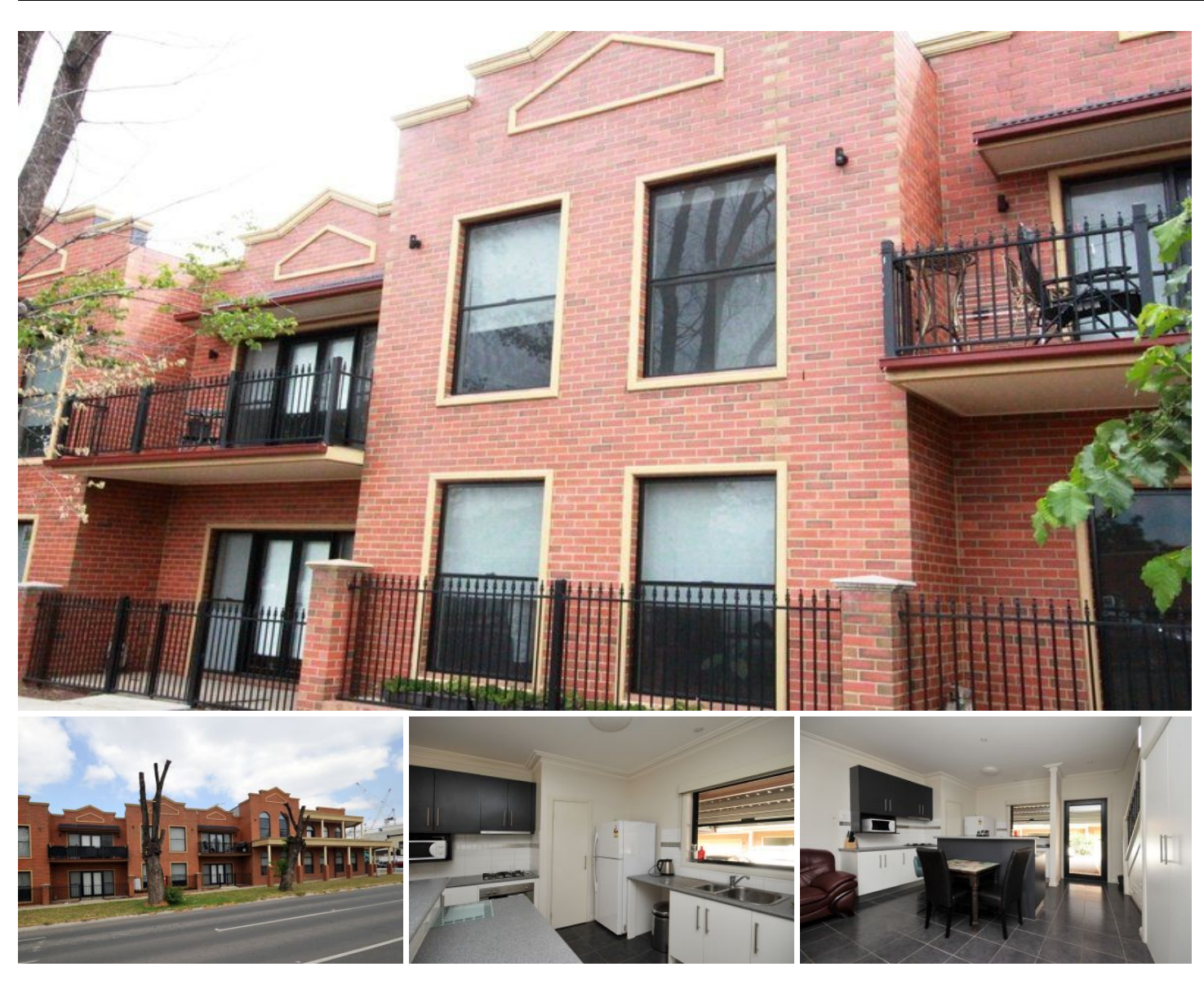
5/83-87 Arnold Street Bendigo VIC

5/83-87 Arnold Street is a fantastic double story townhouse, centrally located and is now taking applications for lease!